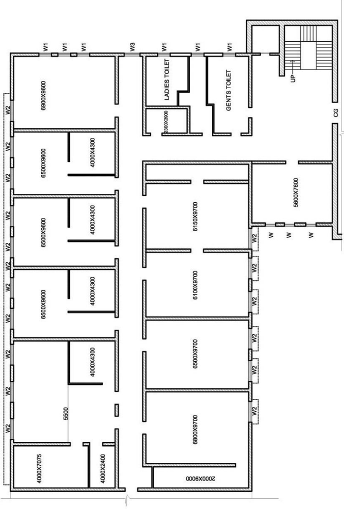
EXISTING PLAN OF BIOLOGY DEPARTMENT (3RD FLOOR)